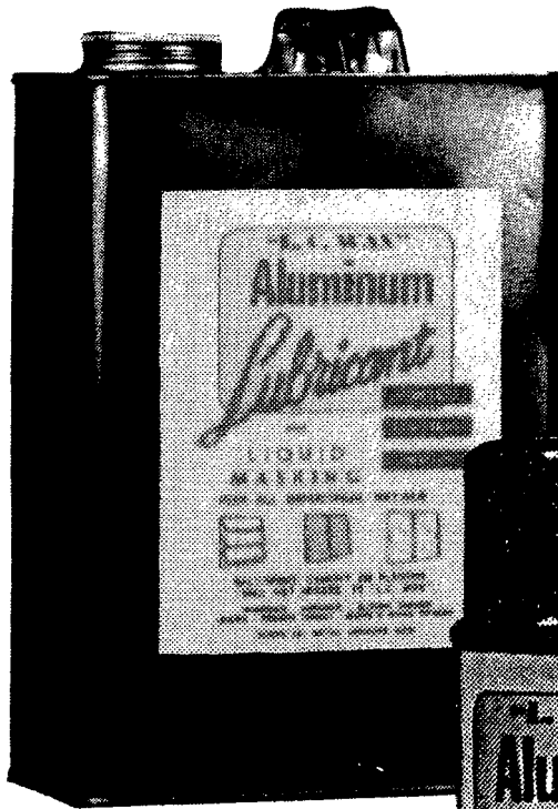
CHM 61 L.C. WAX GALLON

L.C. WAX Aluminum Lubricant • PENETRATES • PROTECTS • WEATHERPROOFS Prevents Oxidation and Rust and does it BETTER