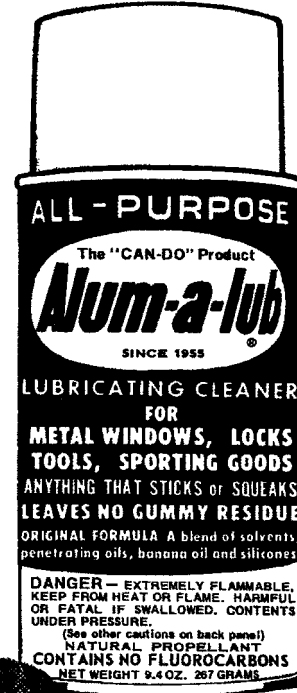
CHM 50 ALUM-A-LUB