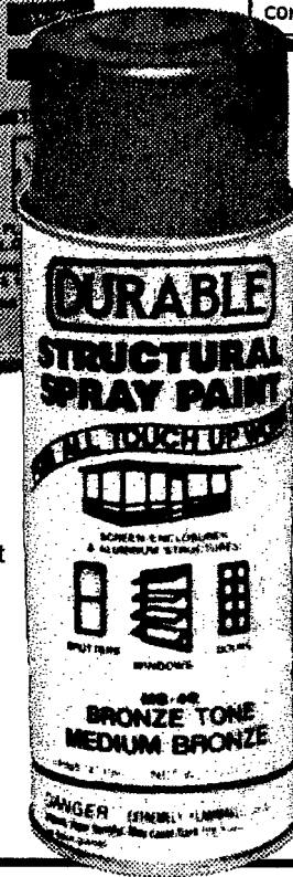
PAINT CHM 10 WHITE CHM 20 MB 40 BRONZE CHM 40 ALUMINUM